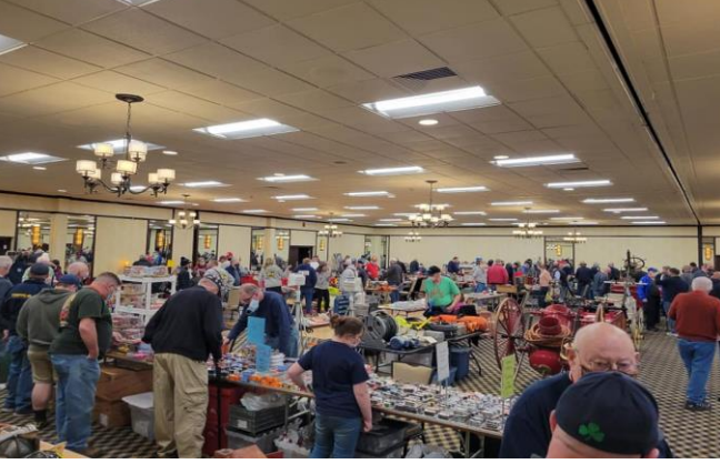
Busy Flea Market