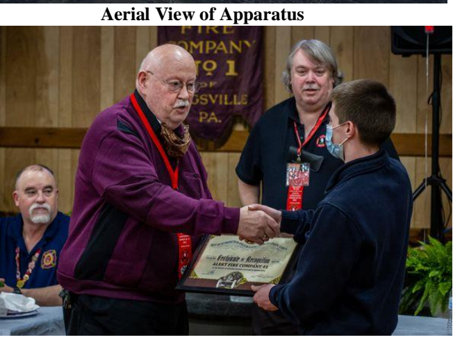
Presentation of the Restoration Award to Alert F.C.